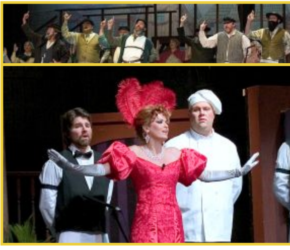
*A paid Annual Voting Membership is required in order to perform in any of CCT's productions.

Please make checks payable to: Town of Colchester